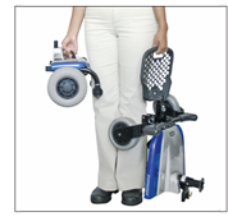
Extra light weight