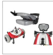
Connectorless technology for easy assembly