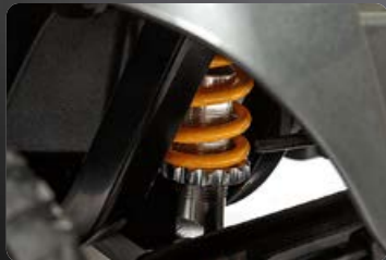
Pride's CTS Suspension