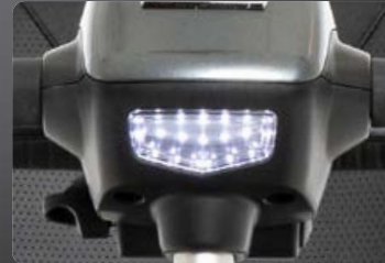
LED headlight in tiller