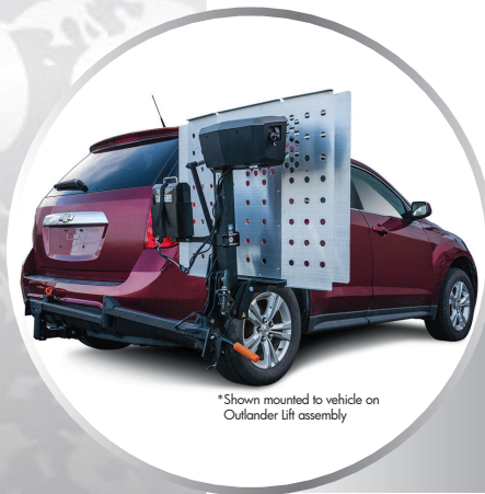
*Shown mounted to vehicle on Outlander Lift assembly