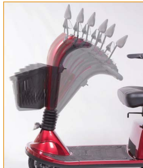
Patented infinite adjustable tiller