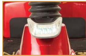
Angle adjustable LED headlight creates a wide path of bright light

2 . Electronics warranty excludes batteries.