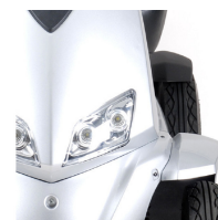
LED lighting system