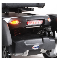
LED lighting system