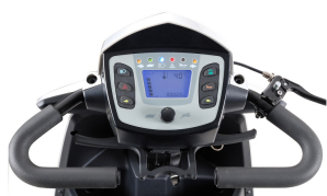
Digital LCD dashboard display