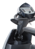
Mecha lock tiller