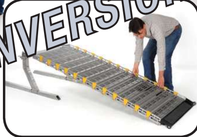
Easily deploys for use