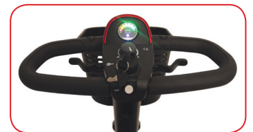
Wraparound Delta Tiller

The Go-Go ® Sport delivers high-performance and convenience on the go. With a 325 lb. weight capacity, a charger port in the tiller, standard front LED lighting and a maximum speed up to 4.7 mph., the Go-Go ® Sport is feature rich and travel ready.