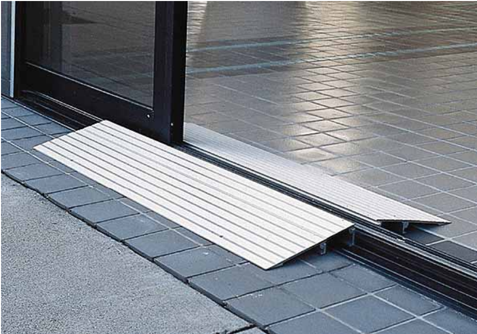
Ideal for sliding doors (two ramps shown)

The EZ-ACCESS® Threshold ramp is a lightweight yet durable free-standing modular ramp designed for doorways, sliding glass doors and raised landings. This seam-free ramp is 34" wide and easily accommodates thresholds from ¾" to 6" high. Ideal for use with wheelchairs, walkers, and cane users. Made of anodized aluminum and is intended for indoor or outdoor use.