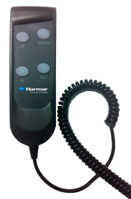
Easy-to-use hand control with Soft-Touch buttons.